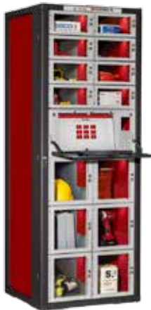
AutoLocker stations provide 24-hour access to high value, oversized, calibrated and durable products.