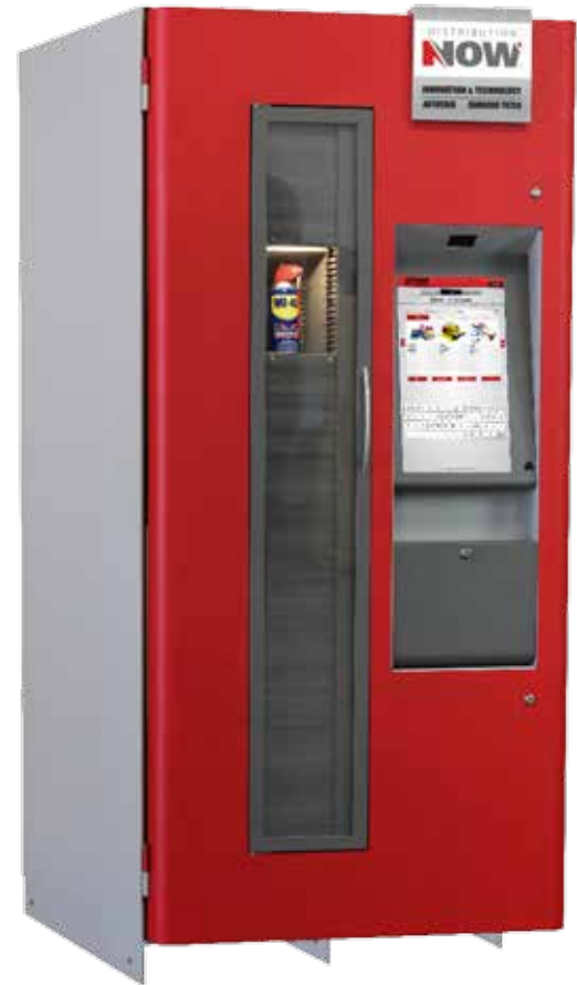
AutoCrib Tambour TX750 - The system in its most dense bin size configuration provides for up to 900 bins.