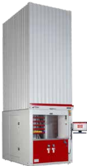
Vertical Lift Module (VLM) is designed to optimize your facility's layout by taking advantage of unused overhead space.