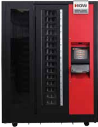
AutoCrib RoboCrib LX2000 - This unit has been designed to provide secure access to over 2,000 different items.